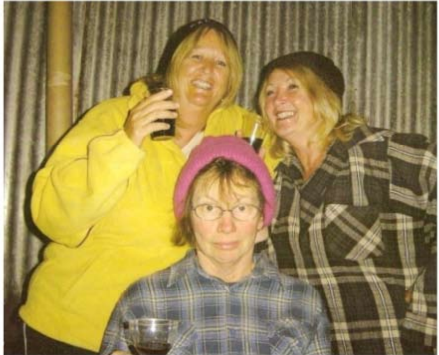
Sisters by Alison Quigan and Lucy Schmidt Foxton Little Theatre's latest production

News from the New Zealand Theatre Federation Inc. www.theatrenewzealand.co.nz