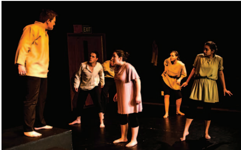
A scene from Oedipus the King (extracts) presented by FAHS Feilding High School