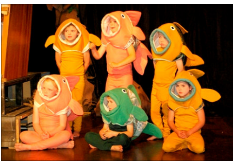
Little fishes waiting for their cue.