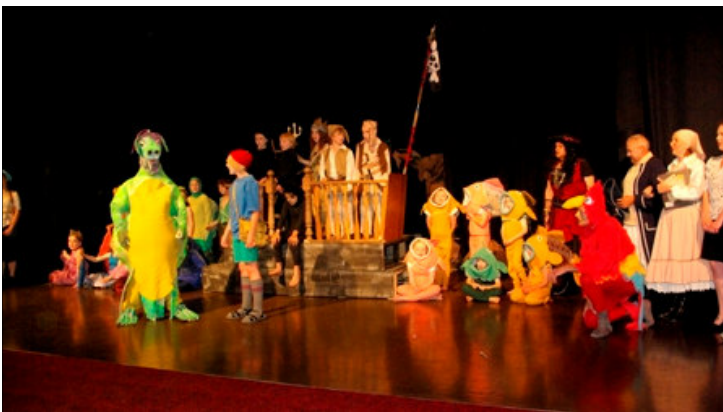
Some of the 40 strong cast for "Puff the Magic Dragon"

The entire community gets behind OnStage Productions for all their endeavours, but Christmas is such a special time and everyone loves a pantomime. Then just to round out the year OnStage takes part in the annual Santa Parade in Westport.